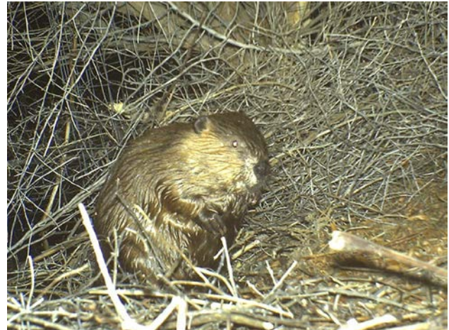
This beaver was the first to appear at Rio Bosque since 2010. (Photo: January 22, 2019)

During the first 12 years of the wetland project at Rio Bosque, beavers moved onsite in some winters, when abundant water flowed through the park and the wetland cells were flooded. But not since the winter of 2009-10 was a beaver present at the park...until this year. On Jan 10, we saw the first tell-tale signs: lower limbs chewed off a young Goodding willow. For the next 2 months, the beaver made itself at home along the old river channel, dining on the inner bark